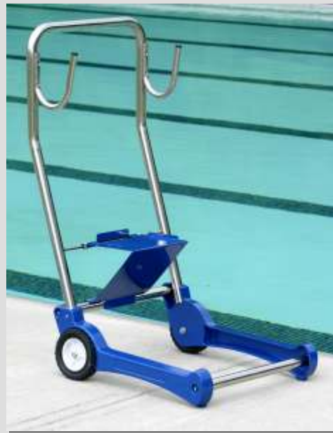
All three units are delivered with a stainless steel Ultrakart.